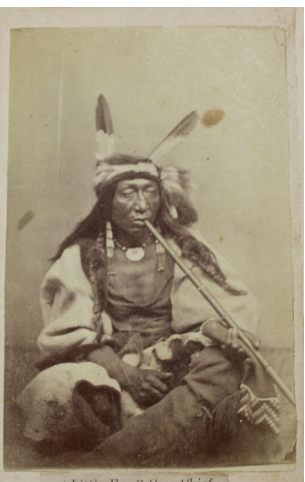
" Little Fox," Cree Chief.

Dates: [ca. 1874-1875]. Description: 2 ½" by 4"; on the reverse: "neg. (1) 522, Copies like this can be had at any time" Sold by: Jeffery Kraus Antique Photographic Images (New Paltz, NY). Website: <u>https://antiquephotographics.com/</u> Price: $750 (+ $15 postage) US (2021).